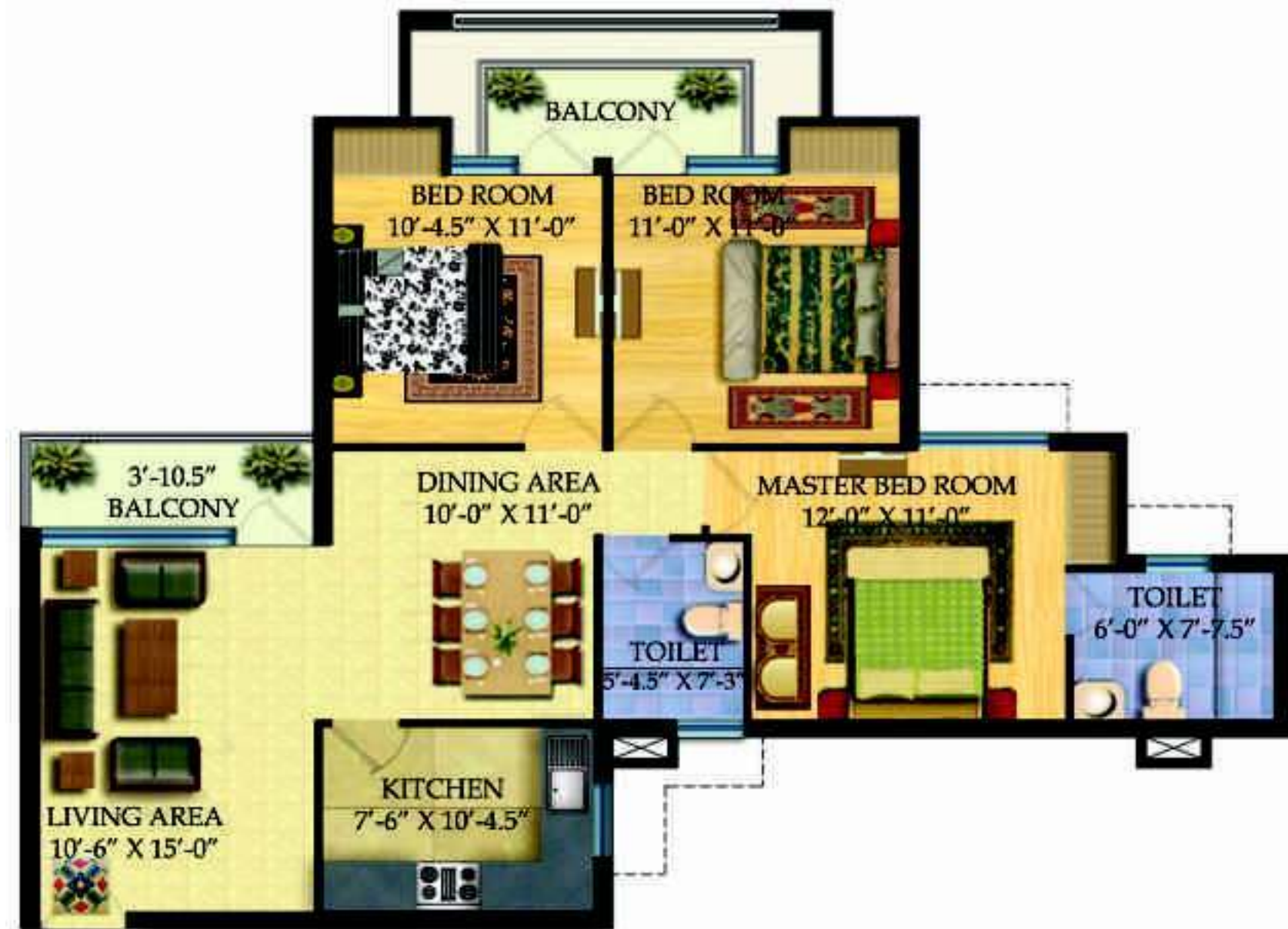
Three Bedroom Layout

Three Bedroom Apartment Super Area: 1405 Sq. ft. Two Bathrooms Extra Wide balconies