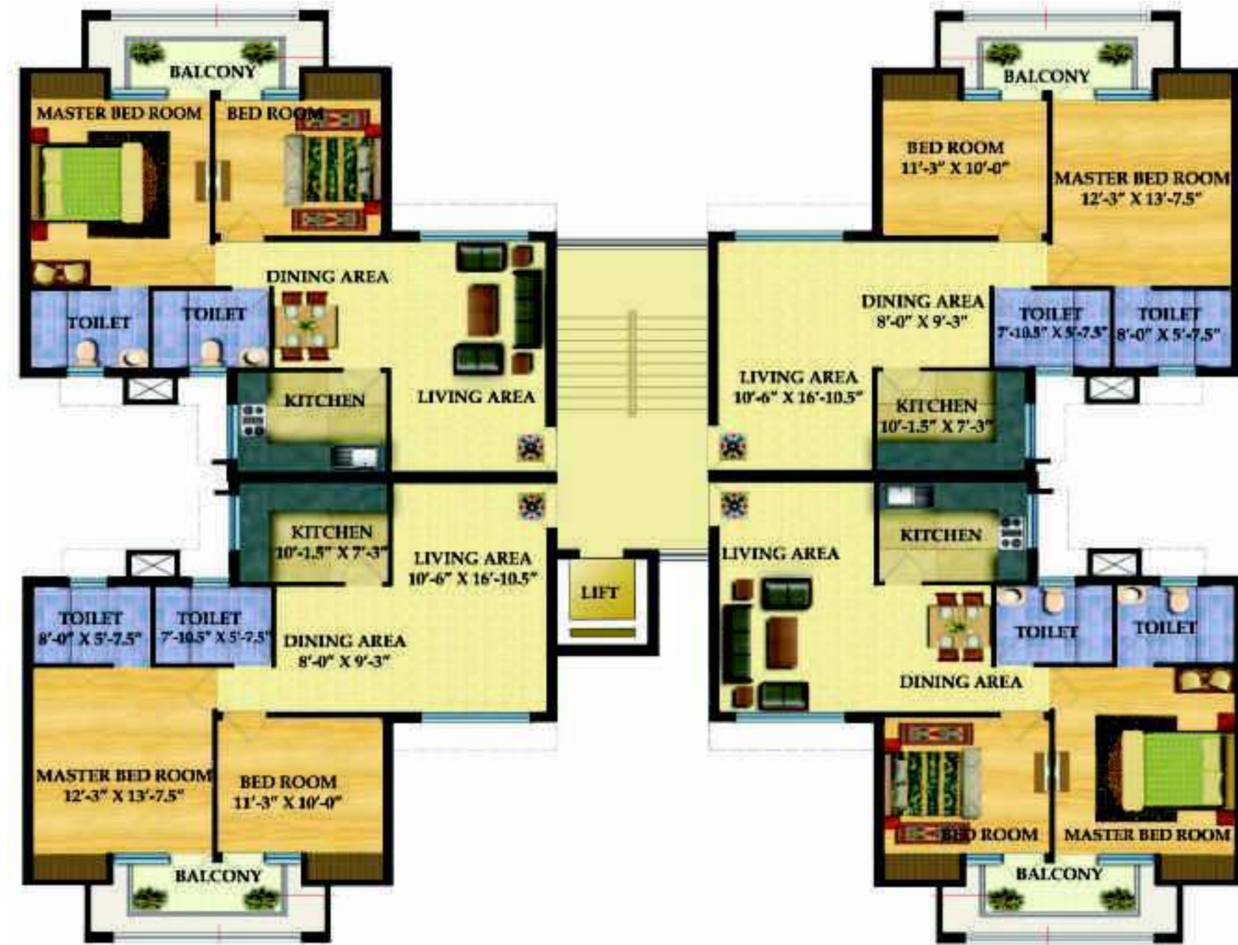
Two Bedroom Cluster Plan