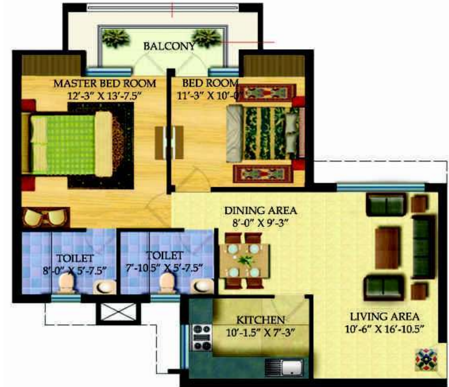
Two Bedroom Layout

Two Bedroom Apartment Super Area: 1205 Sq. Ft. Two Bathrooms Extra wide balconies