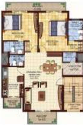
1st & 2nd floor

250 sq. mtrs. (approx.) Tentative sale area: 1475 sq. ft. 2 BHK + Utility