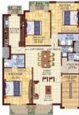
1st & 2nd floor

250 sq. mtrs. (approx.) Tentative sale area: 1550 sq. ft. 3 BHK + Utility