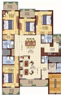
1st & 2nd floor

420 sq. mtrs. (approx.) Tentative sale area: 2250 sq. ft. 4 BHK + Utility