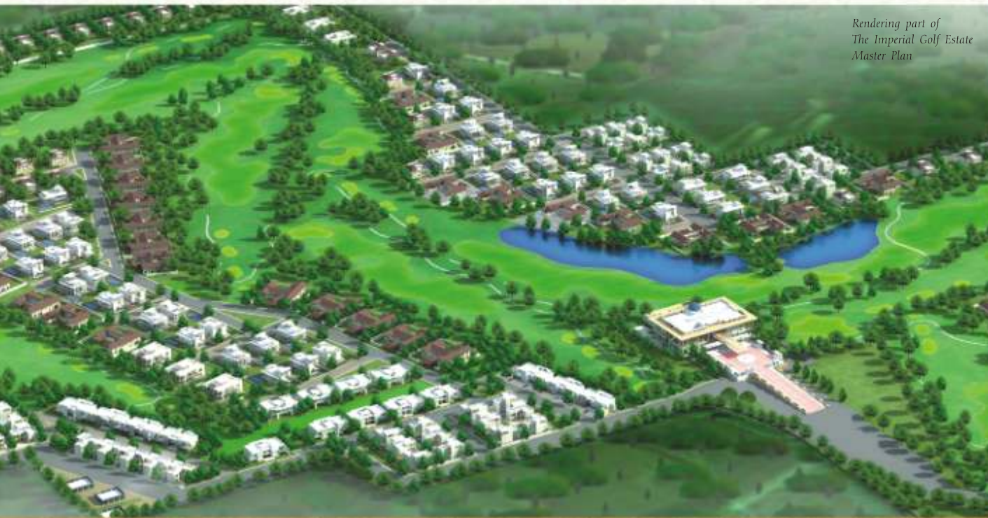
Rendering part of The Imperial Golf Estate Master Plan