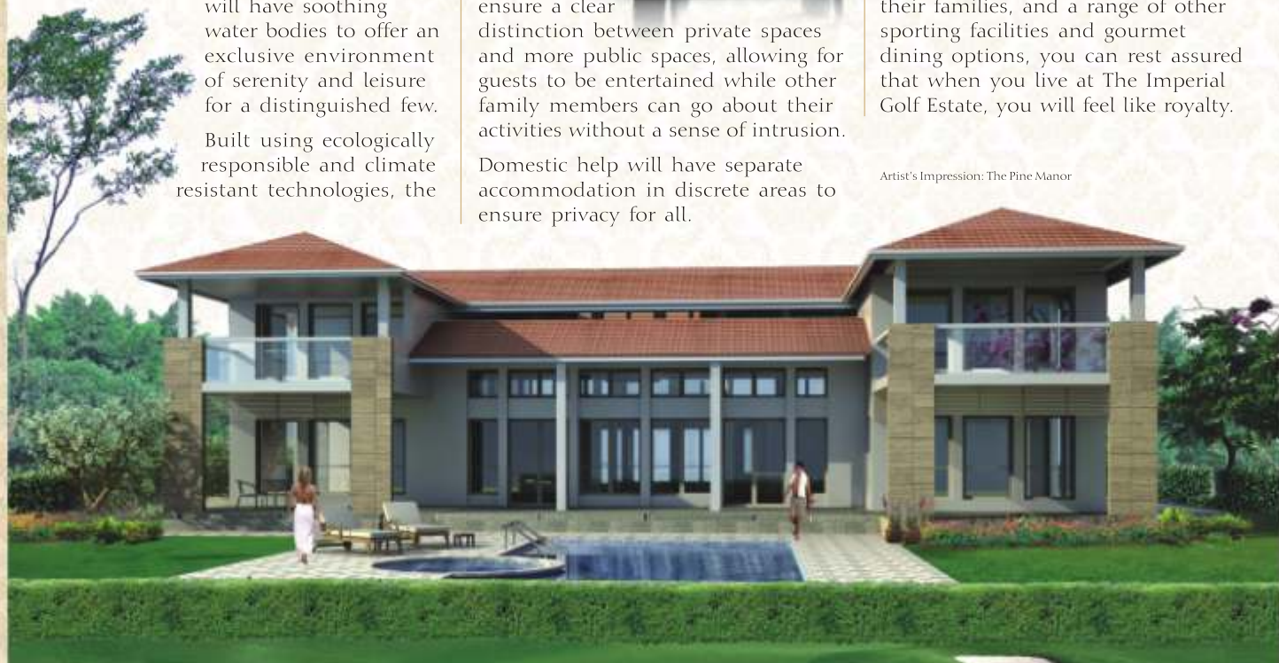
Artist's Impression: The Pine Manor

Along with the exceptional facility of a state-of-the-art, well equipped clubhouse that caters to the recreation needs of residents and their families, and a range of other sporting facilities and gourmet dining options, you can rest assured that when you live at The Imperial Golf Estate, you will feel like royalty.