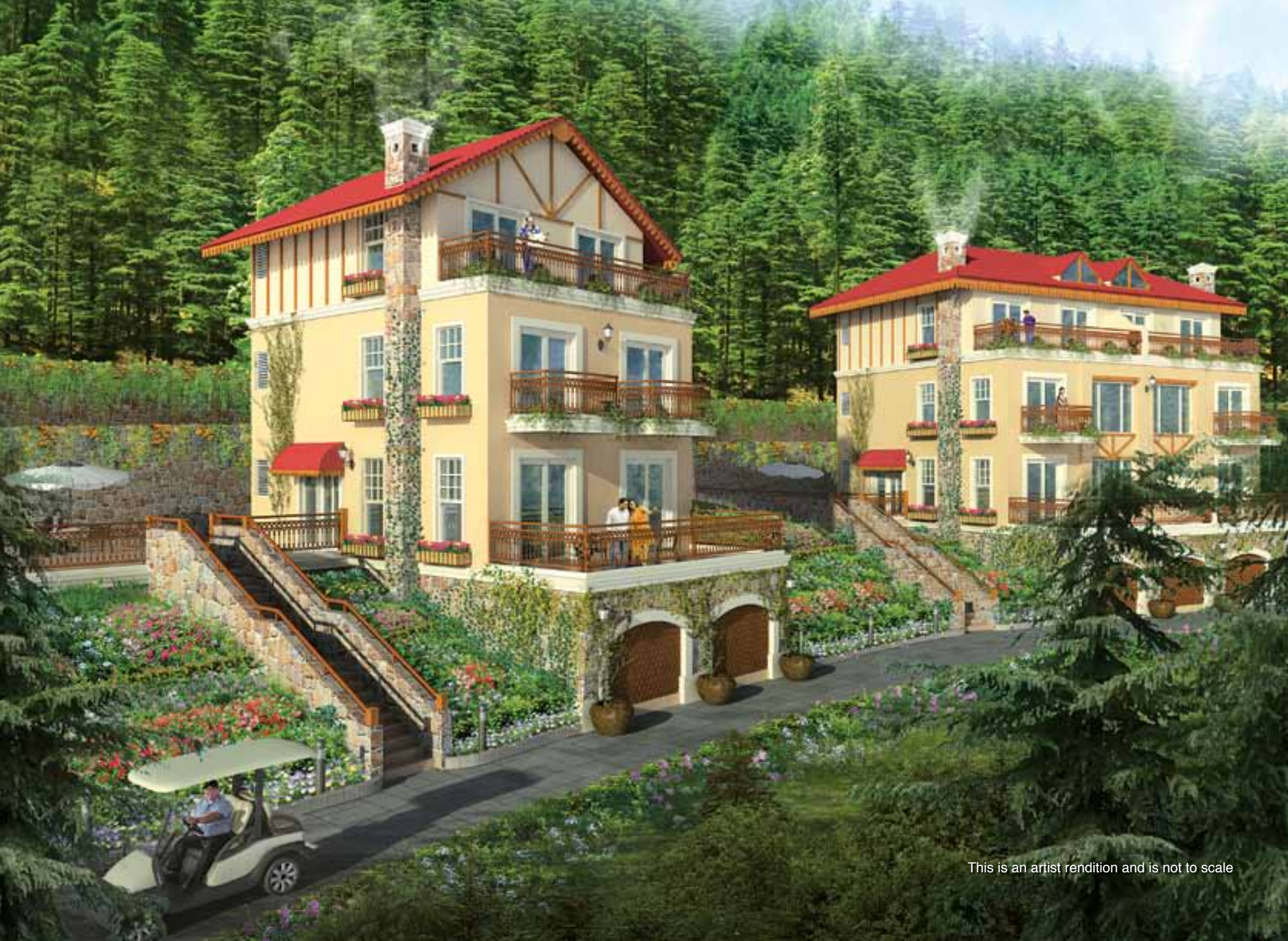
This is an artist rendition and is not to scale